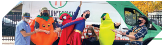
We Don't Waste staff dressed in costumes for the Garden Place Academy Market on Halloween.

And we managed to have some fun doing it!