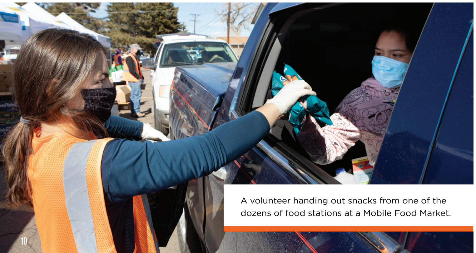
A volunteer handing out snacks from one of the dozens of food stations at a Mobile Food Market.

Kiewit Meridiam Partners (KMP) continues to be an outstanding partner to We Don't Waste. As a founding partner and the very first sponsor of our Mobile Food Market initiative, KMP has continued to support this high-impact effort to increase food security in low-income neighborhoods, ensuring We Don't Waste is able to provide vital food access for food-insecure families and individuals in our community.