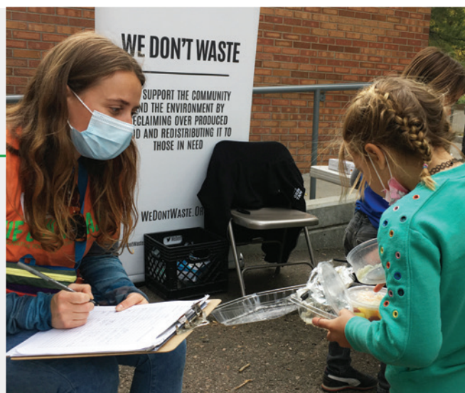
A student demonstrates the food she is throwing away from her school lunch during a food waste audit.

Our education program ramped up in 2021, with an increasing number of classroom presentations, as well as food waste audits in schools across Denver. From first grade, through high school, students learned about the importance of reducing waste, and gained hands-on experience trying new habits to reduce food waste at home and at school.