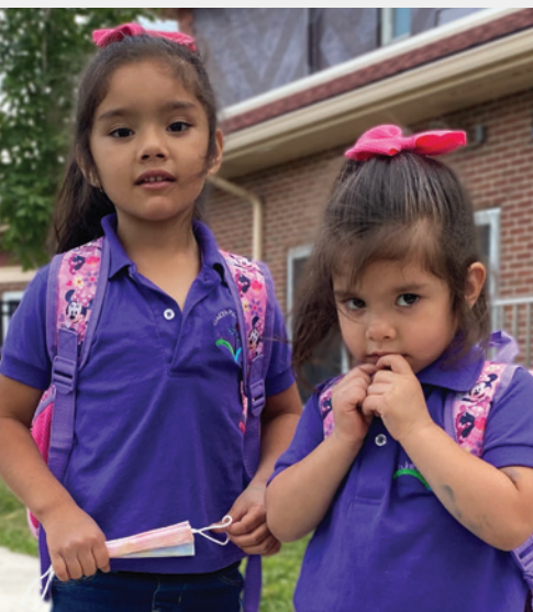
Sisters picking up food with their parents at a walk-through market after school.